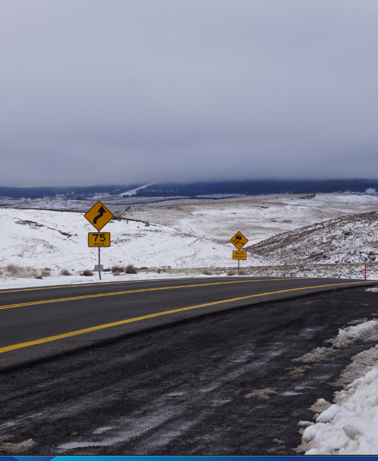
*Public Passenger Vehicles are defined as having 13 seats or MORE, including the driver